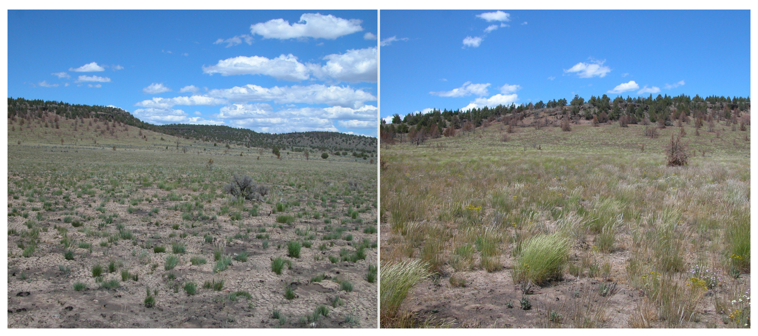
Figure 1. Wyoming big sagebrush sites in eastern Oregon (about 11 inches of annual precipitation) with an intact understory of perennial bunchgrasses. Left: A site where management objectives had not yet been met and resting from grazing continued. Right: A site where bunchgrass recovery and soil stability objectives had been met and grazing was resumed.

• Careful monitoring and assessment is required to determine when grazing may be resumed, whether post-fire grazing management has been effective, and if changes in grazing management are needed.