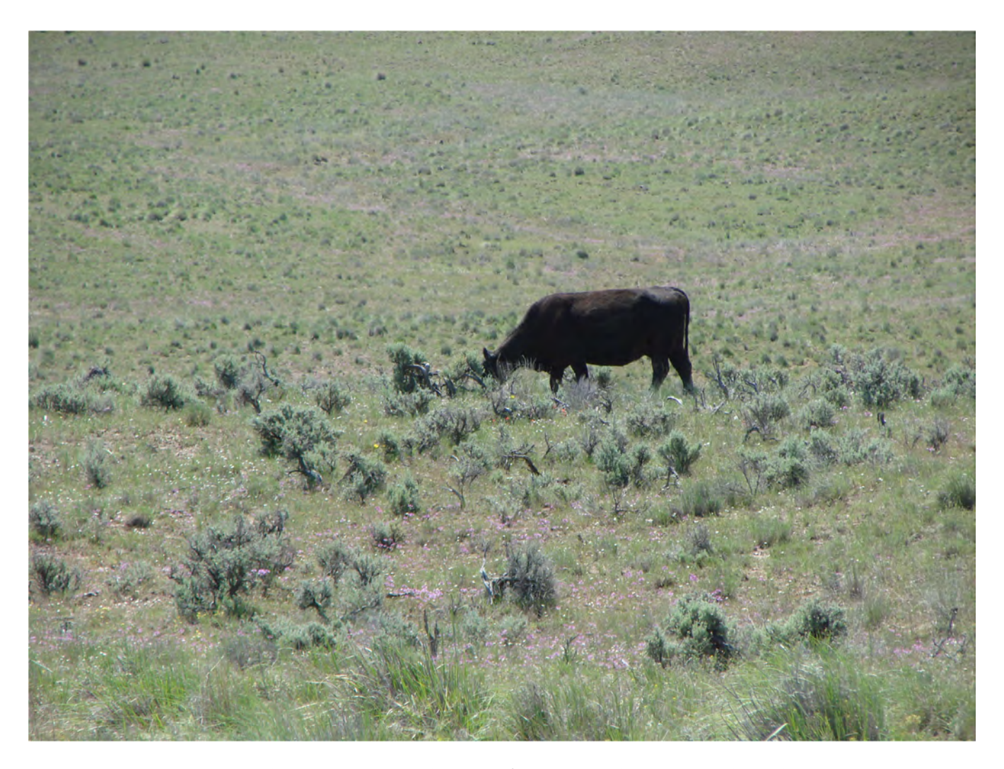
FIGURE 4 Cow grazing a sagebrush community with low levels of invasive annual grass invasion during the growing season in eastern Oregon.

Spring season grazing (Figure 4) may at times also limit invasive annual grasses and possibly open up safe