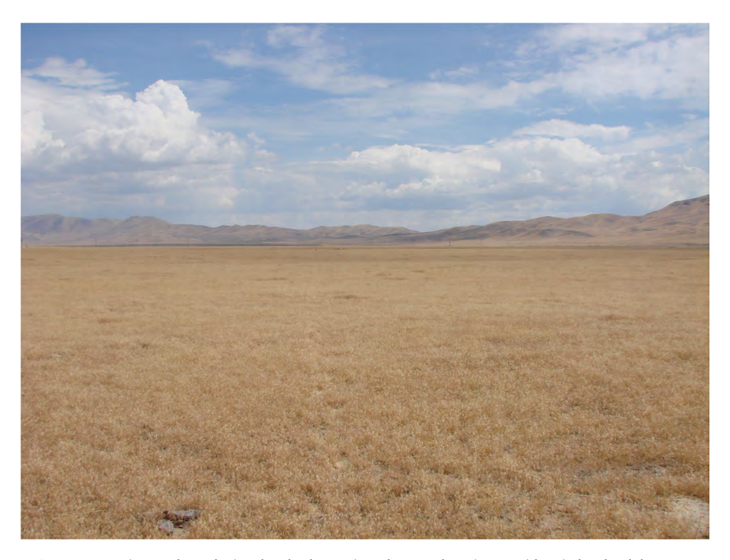
FIGURE 3 Invasive annual grass-dominated sagebrush steppe in northern Nevada. Native perennial species have largely been eliminated because of competition from annual grasses and increased fire frequency.

The widespread nature of invasive annual grasses and minimal success in restoring annual grass-invaded communities limits the effectiveness of traditional "control and seed" restoration strategies (Davies, Leger, et al., 2021). The scope of the annual grass problem necessitates the use of treatments that can be applied at large spatial scales, which greatly limits treatment options. Livestock grazing is a treatment conducive for application at large spatial scales but would need to be applied strategically to limit invasive annual grasses, while avoiding unintended consequences. This is especially important