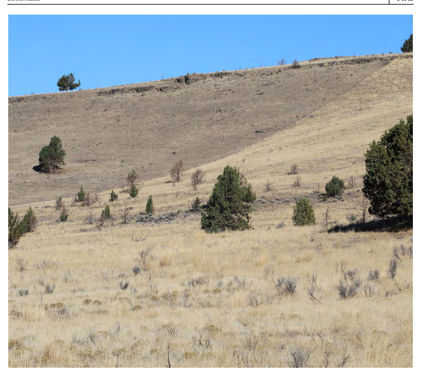
FIGURE 2 Fuel break created with strategically applied grazing in an invasive annual grass-dominated sagebrush steppe in southeastern Oregon. Photo credit: Kirk Davies.